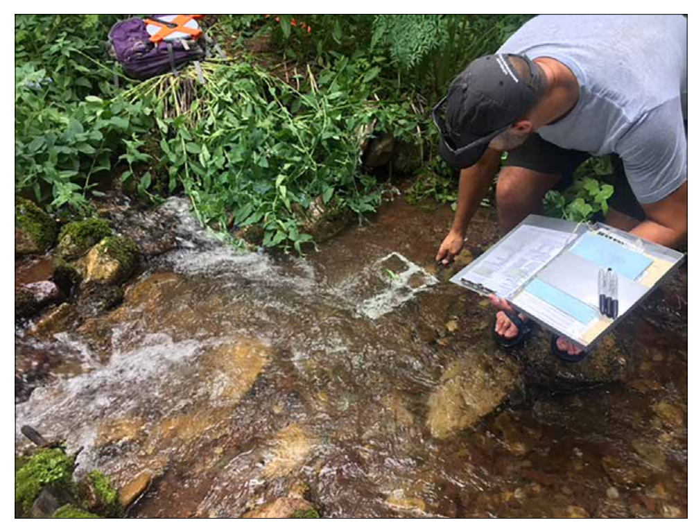
A device called a "gravelometer" (shown in the water) is used to measure the size of sediments (pebbles, cobbles, etc.) found in the stream banks and bed. This is one of many data variables collected by the Watershed Program to assess stream channel stability.

This system allows us to identify weak links and to discover what, if any, opportunities exists to correct the condition. Unnaturally high rates of stream bank erosion and bed mobility can have multiple causes. These