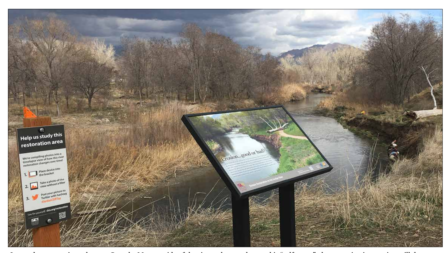
Located at approximately 5100 S on the Murray side of the river, photos taken at this "self-serve" photo monitoring station will document change on the eroding streambank shown on the right. Look closely and you can see Watershed Program staff in the water! We were installing a bank stabilization technique in February 2018, to help slow down the rate of active erosion.

Learn more at https://2018watershedsymposium. eventbrite.com