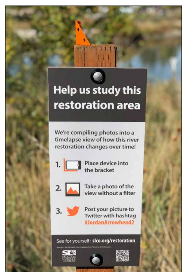
Salt Lake County Watershed is crowdsourcing photos to help monitor change at our stream restoration projects along the Jordan River.

Much of the Jordan River's banks and historic floodplain have been (continued on page 4)