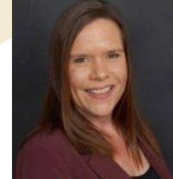
KELLY BUSH MAYOR