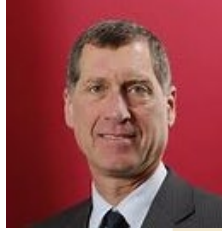
HARRIS SONDAK MAYOR