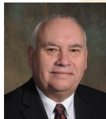
BLAIR CAMP MAYOR