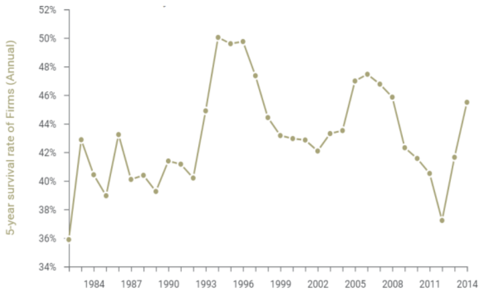
Figure 2. Challenges in Firm Longevity across Salt Lake County and Utah

Additionally, newly created jobs and locally retained jobs have a local multiplier effect. Whenever a new job is created, there is a chance that additional jobs may also be created via increased demand for local goods and services. Several scholars have found strong evidence for the presence of the local multiplier effect. Within tradable industries, UC-Berkeley-based economist Enrico Moretti discovered that, for each additional skilled job created, 2.5 jobs were also generated in the local non-tradable goods and services sectors, and an additional unskilled job created 1 job in the local non-tradable sector. 8 Revenues from small businesses also have a large impact on local economies, with 48% of sales on average being recirculated into the local economy compared to 14% of purchases at chain and non-local stores. 9