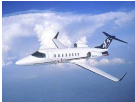
E. JET AIRPLANE