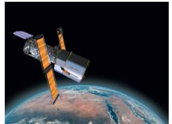
F. HUBBLE SPACE TELESCOPE