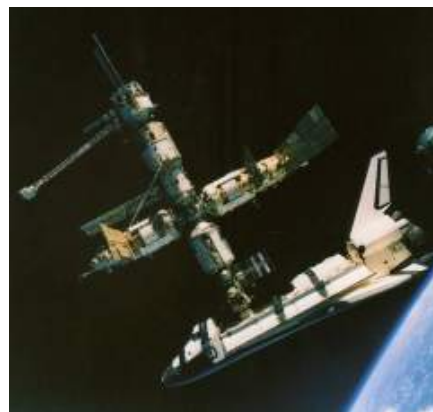
C. SPACE SHUTTLE