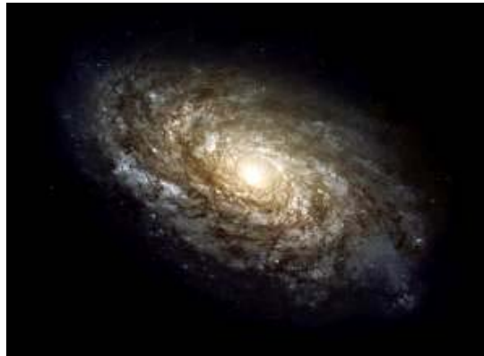
B. A GALAXY