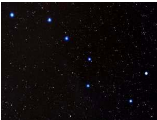
H. STARS OF THE BIG DIPPER