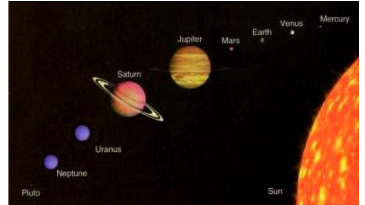
E. THE SOLAR SYSTEM