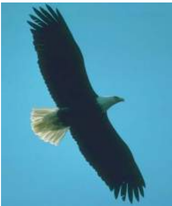
G. AN EAGLE