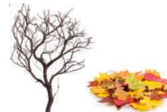
Tree Branches and Leaves

All items should be placed in the green waste can UNBAGGED .