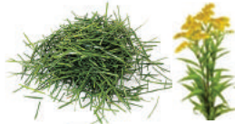
Lawn Clippings and Weeds