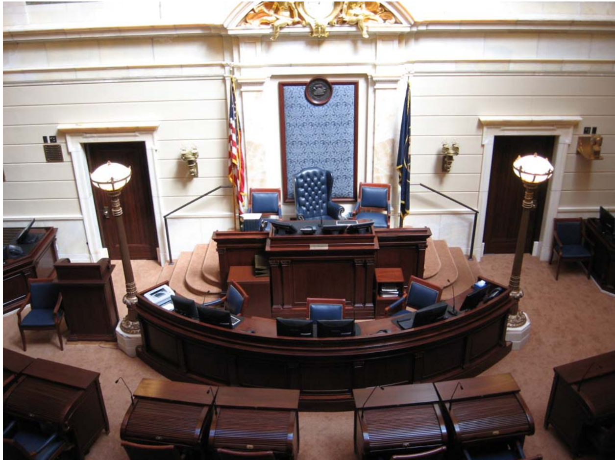
Utah State Senate Chamber, Salt Lake City, UT

The following is a letter that was received on November 15, 2007 from the Salt Lake County District Attorney's Office. This document provides a summary of the core legal authorities necessary to implement the Water Quality Stewardship Plan (WaQSP). Additionally, an outline of other authorities is included in this appendix.