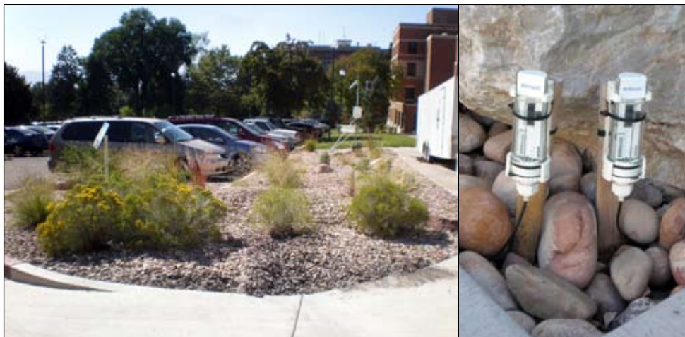
What looks like a typical commercial landscape is actually a bioretention garden that collects and uses stormwater runoff at the University of Utah's Civil & Material Engineering building. Soil moisture meters (right) are used to monitor effectiveness, with the goal of installing bioretention gardens campus-wide.