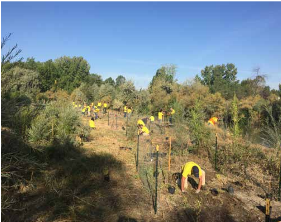
Stantec Planting along the Jordan River

The folks at Salt Lake County Watershed are very appreciative of the help Stantec has provided, both in the form of the grant and volunteer time. Stantec appreciates the opportunity to partner with Salt Lake County on such a valuable project that hits so close to home.