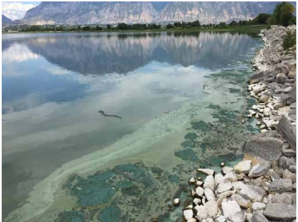
HABs on Utah Lake