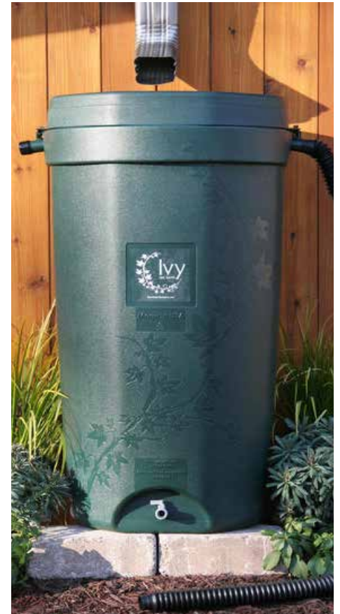
Rain Barrel

Community based water conservation programs like RainHarvest not only help reduce demand on municipal systems and improve water quality of local rivers and lakes, they also give residents something tangible to grasp in a water system where everything is out of sight and out of mind. In concept, once an individual starts capturing rain, their passions concerning water conservation will grow along with their gardens including a greater consciousness of how our water use is connected to our rivers and the wildlife communities they support.