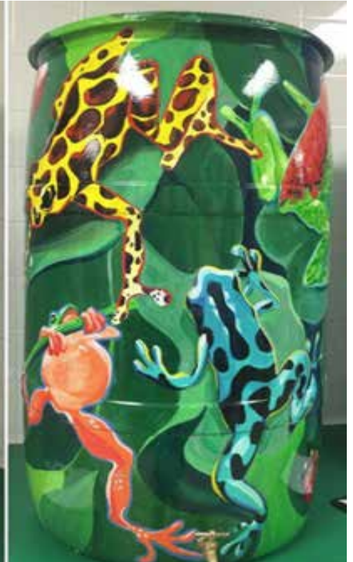
Painted Rain Barrel by Lauren Kuhns

Ogden and Eagle Mountain have partnered with the Utah Rivers Council to distribute over 3200 rain barrels to Utah residents. This means every time it rains enough to fill a 50 gal barrel there is a potential to redirect the use of up to 160,000 gallons of water through this simple practice.